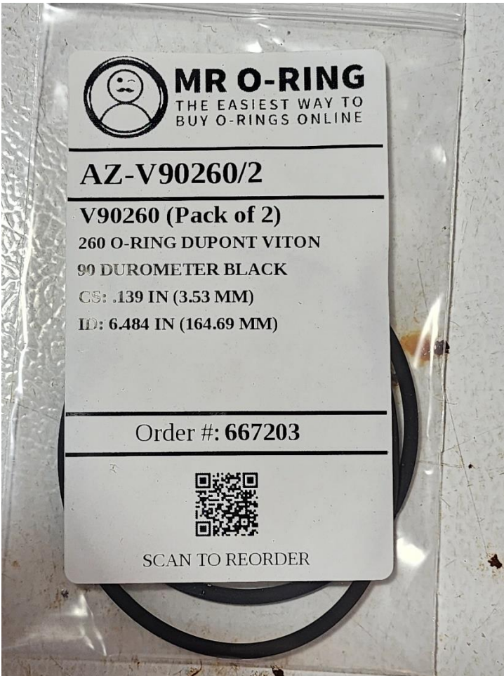
New o-ring drive belt package from MR O-RING. Spec's & part# are on the pack of 2.