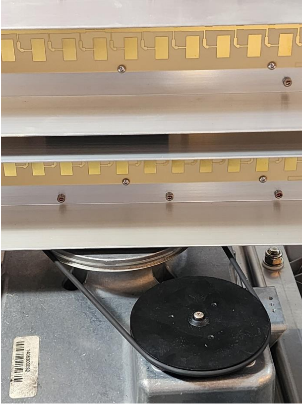
New o-ring drive belt in place.