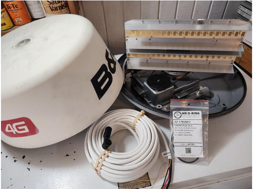
Package B&G 4G Radar, Radar Cable & extra o-ring drive belt with spec's.